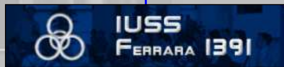
The venue for Day of Study and Training