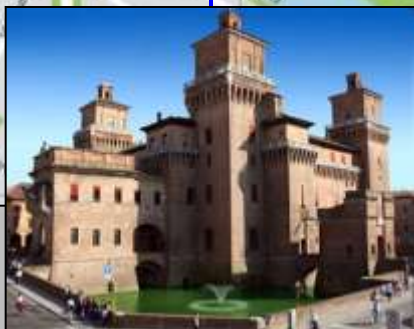
The venue for conference "Castello Estense"